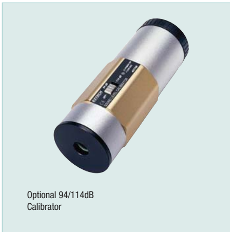
Optional 94/114dB Calibrator