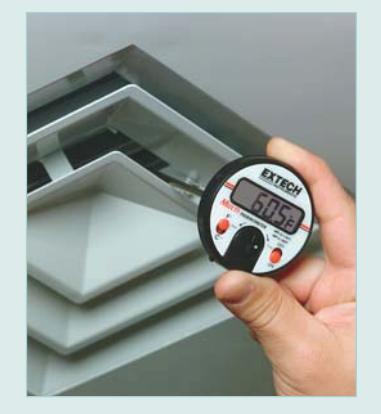
Stem thermometer ideal for measuring temperature in HVAC applications such as air ducts, vents, and heaters.