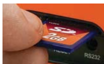
SD memory card included

Transfer data from meter to PC using Excel ® software and datalogged readings from the SD memory card (included)