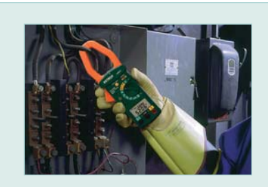
True Power and Phase Indication for enchanced versatility and performance.