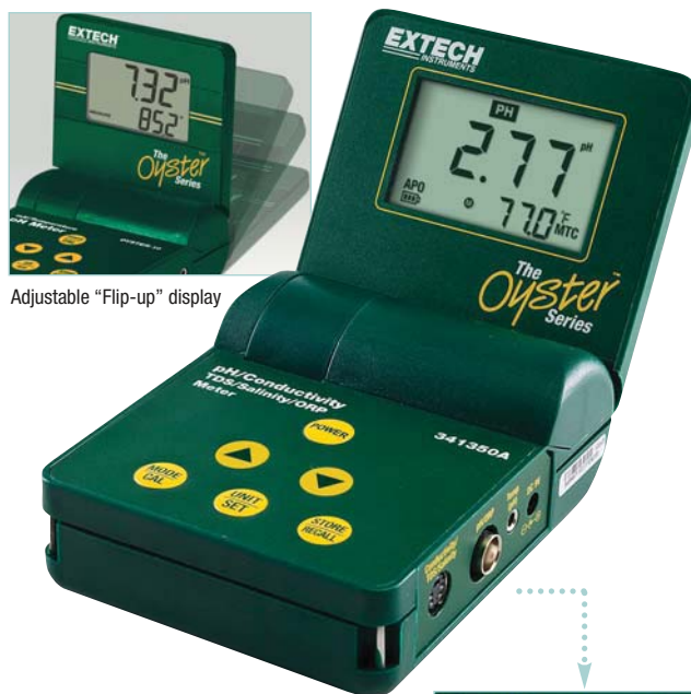
Adjustable “Flip-up” display