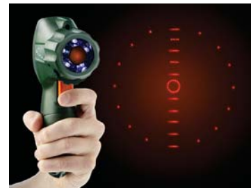
Coaxial laser shows you the area being measured to maintain accurate measurement distance