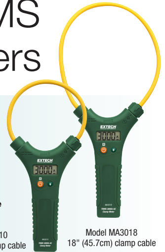
Model MA3010 10" (25.4cm) clamp cable

Flexible clamp jaw easily wraps around bus bars and cable bundles that may be difficult to access with regular clamp meters. The thin 7.5mm cable diameter easily fits into tight spaces. Choose between a 10" (25.4cm) or 18" (45.7cm) cable clamp length to accommodate your application needs.