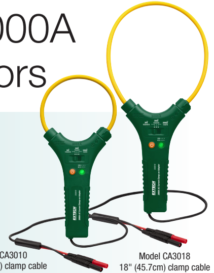
Model CA3010 10" (25.4cm) clamp cable

Expand your meter's capabilities to measure AC Current up to 3000A. Fit most MultiMeters or Clamp Meters with standard shrouded banana plug sockets. Flexible clamp jaw easily wraps around bus bars and cable bundles where standard clamp adaptors and meters can't. The thin 7.5mm cable diameter easily fits into tight spaces. Choose between a 10" (25.4cm) or 18" (45.7cm) clamp cable length.