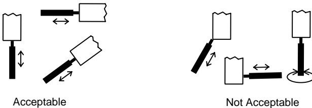
Figure 1 – Correct and Incorrect Angles of Measurement

Note: The sensing head with adapter must be in line with the object being measured. Avoid rotating the sensing head. Refer to the figure below.