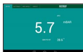
mBAR / TEMPERATURE