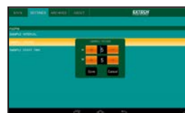
EASY TO NAVIGATE MENUS