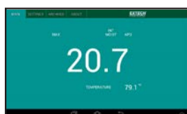
MOISTURE / TEMPERATURE