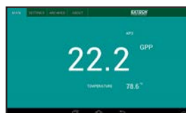
GPP / TEMPERATURE