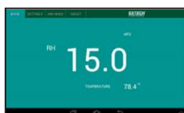
HUMIDITY / TEMPERATURE