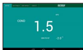
CONDENSATION / DEW POINT