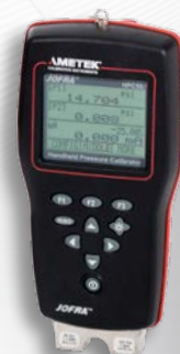
HPC500 HPC502 HPC600

When combined with these JOFRA calibrators, the APM is a powerful calibration tool.