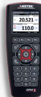
ASC300 ASC301 ASC321 ASC-400 ASC-400 BARO