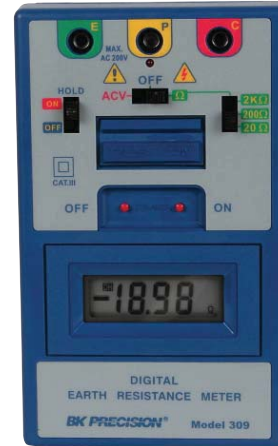
Earth Voltage Measurement