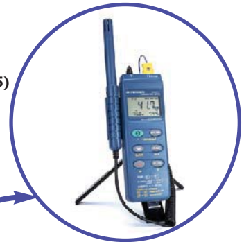
Tripod Mountable (tripod not included)