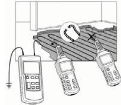
Detects breakers in radiant heating systems