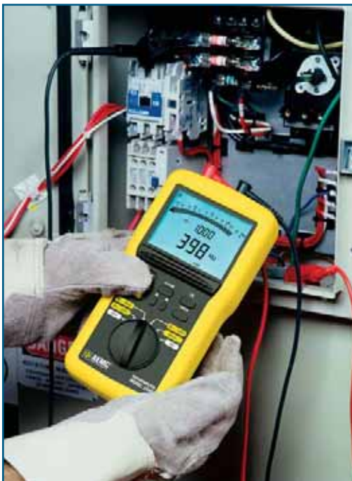
Easy-to-read digital/analog display (backlight on)