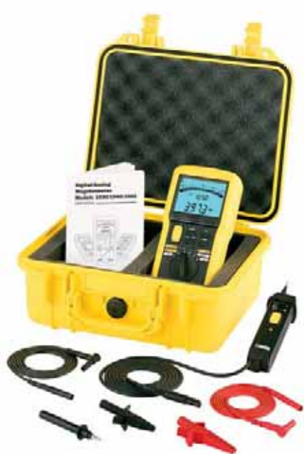
Field Kits Model 1040 Kit, Catalog #2117.30 Model 1045 Kit, Catalog #2117.31