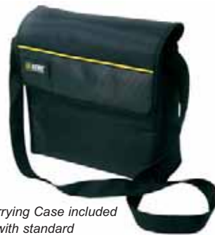
Soft Carrying Case included with standard megohmmeter models Catalog #2119.02