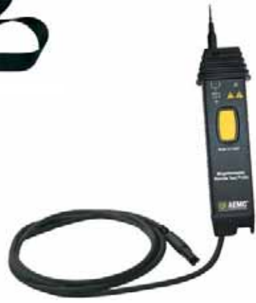
Remote Test Probe for use with Models 1040 & 1045 Catalog #2118.97