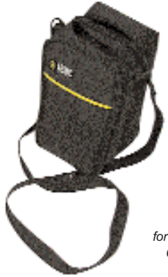
Hands-Free Carrying Case for use with all models Catalog #2118.99