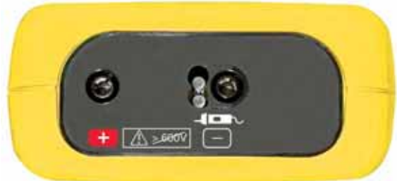
Models 1040 & 1045