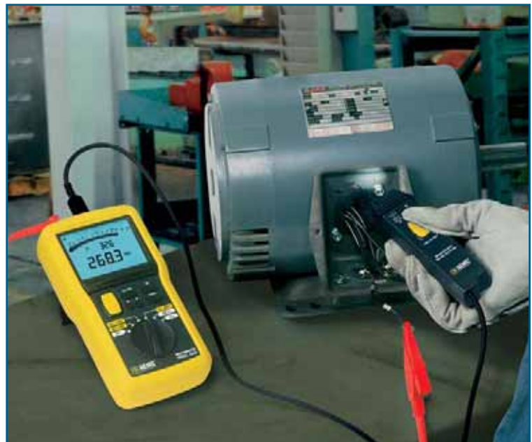
Remote probe used with Model 1045 to initiate a test at the motor. Target light provides good visibility of test area.