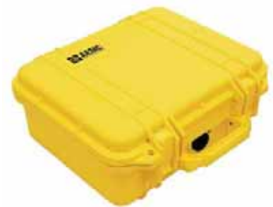
Field Case for use with all models Catalog #2118.98