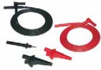
Test Leads standard with all models Catalog #2119.01