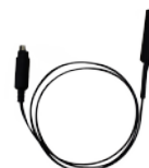
Temp. & RH Extension Probe (TRH-EXT)