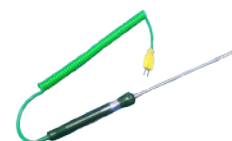
Temperature Probe (E1500SP)