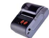
Wireless Bluetooth Printer