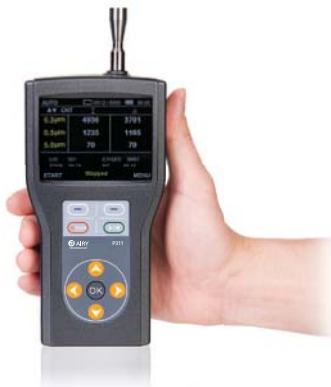
Only 1.26 lbs

The Airy Technology P311 stores 8,000 sample records that can be viewed on the unit or on a computer via USB cable. The P311 complies with ISO 21501-4 and includes a one year warranty. With excellent quality and reliable performance, the Airy Technology P311 is the best priced handheld particle counter in the market.