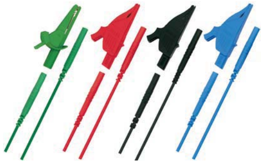
Leads are included with Model AN-1